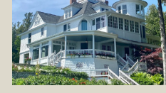
WONDERVIEW COTTAGE West Bluff Road