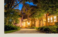
THE INN AT STONECLIFFE 8593 Cudahy Circle