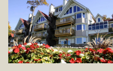
LAKEBLUFF CONDOS & SUITES 3561 Eckel Drive