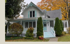
EDGEWOOD COTTAGE Hubbard's Annex