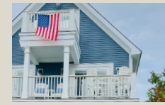
CARRIAGE COTTAGE Mahoney Avenue