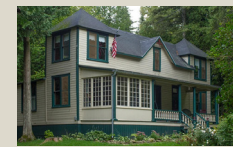
CRANE COTTAGE Grand Avenue

VISIT MACKINACISLAND.ORG FOR MORE LODGING OPTIONS