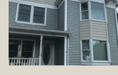
SHIPWATCH CONDO Mission Street