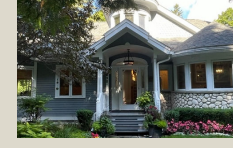
HOLT STREET COTTAGE Holt Street